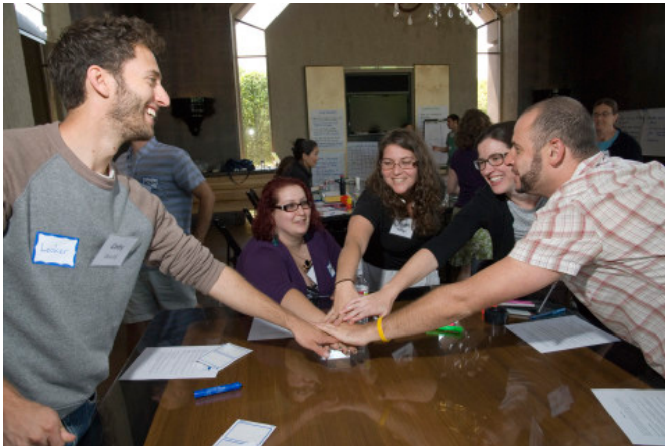
Roots and Branches

How do we take back our experience of giving and become producers of our own philanthropic experiences? How do we become proactive, empowered, intentional—and yes, even joyful—givers?