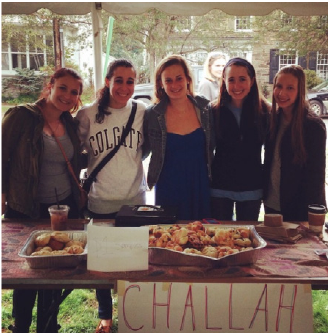
Challah for Hunger students selling challah