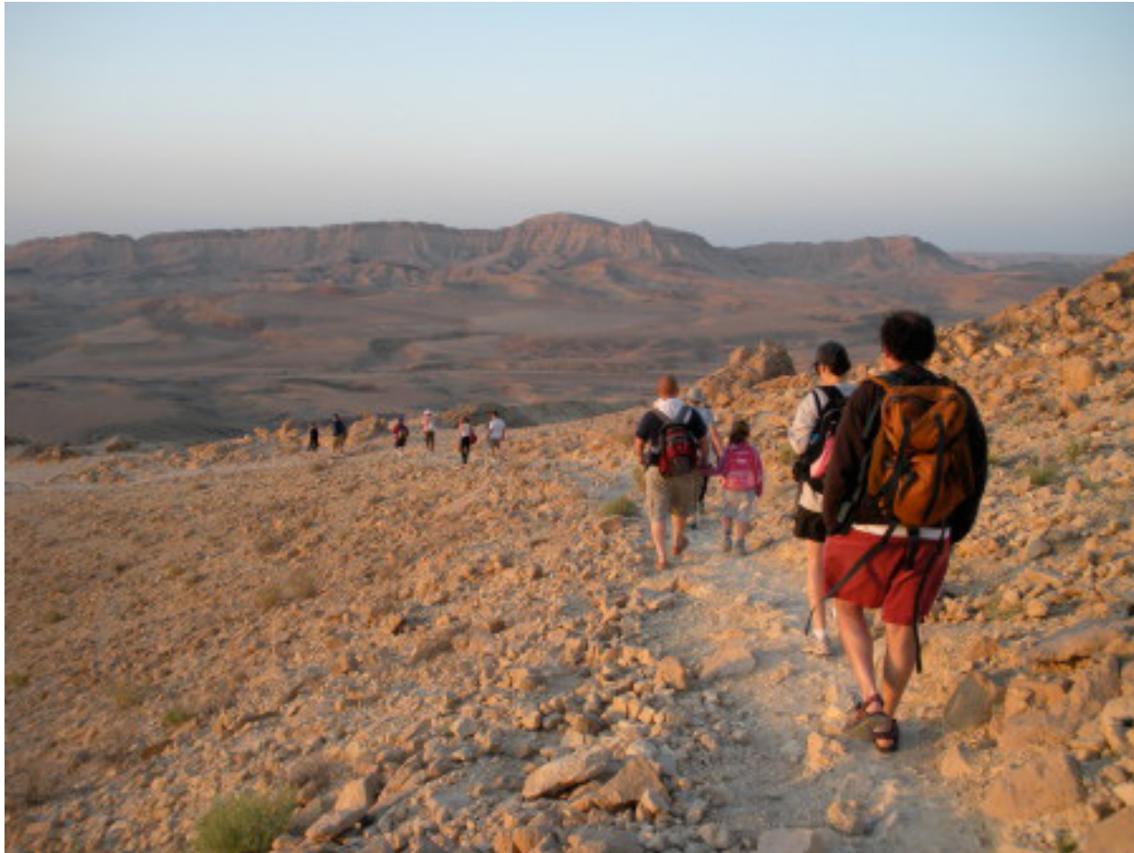
Natan Fund Israel trip

The first thing most people think of when they hear “giving circle” is money. That makes sense: as I discussed in Part I of this series, giving circles are about giving money and empowering givers to give proactively and thoughtfully to effect real change in the world.