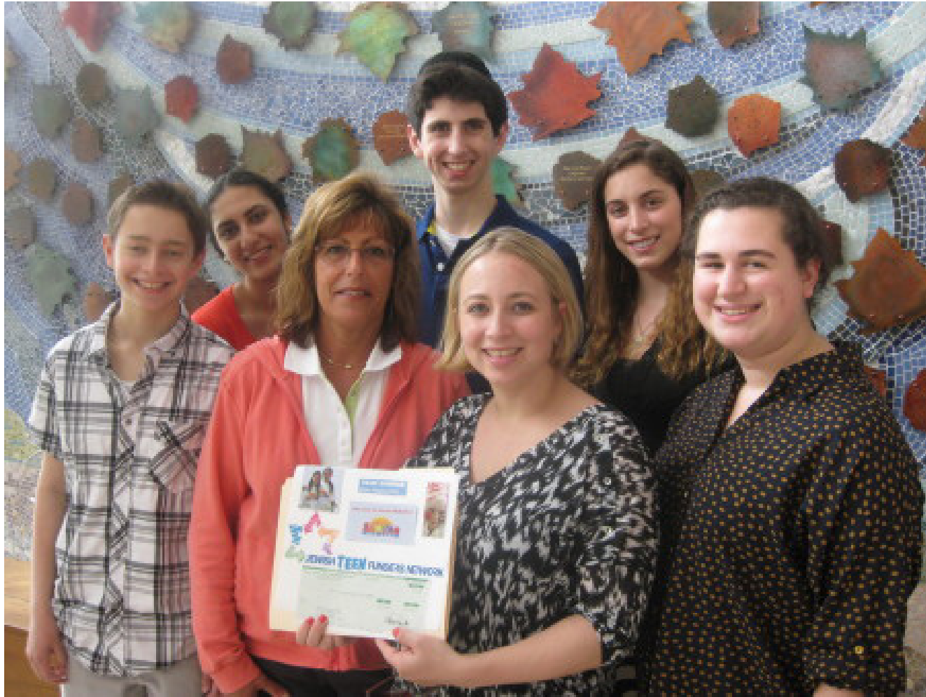
JTFN Team Surprise