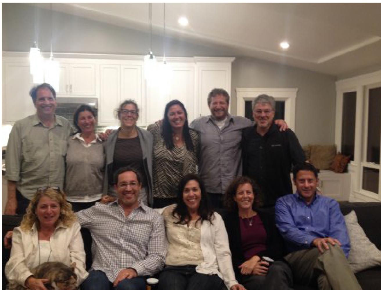
JCF Israel Giving Circle

new stakeholders who now have a much deeper understanding of how Federation works and what it supports.