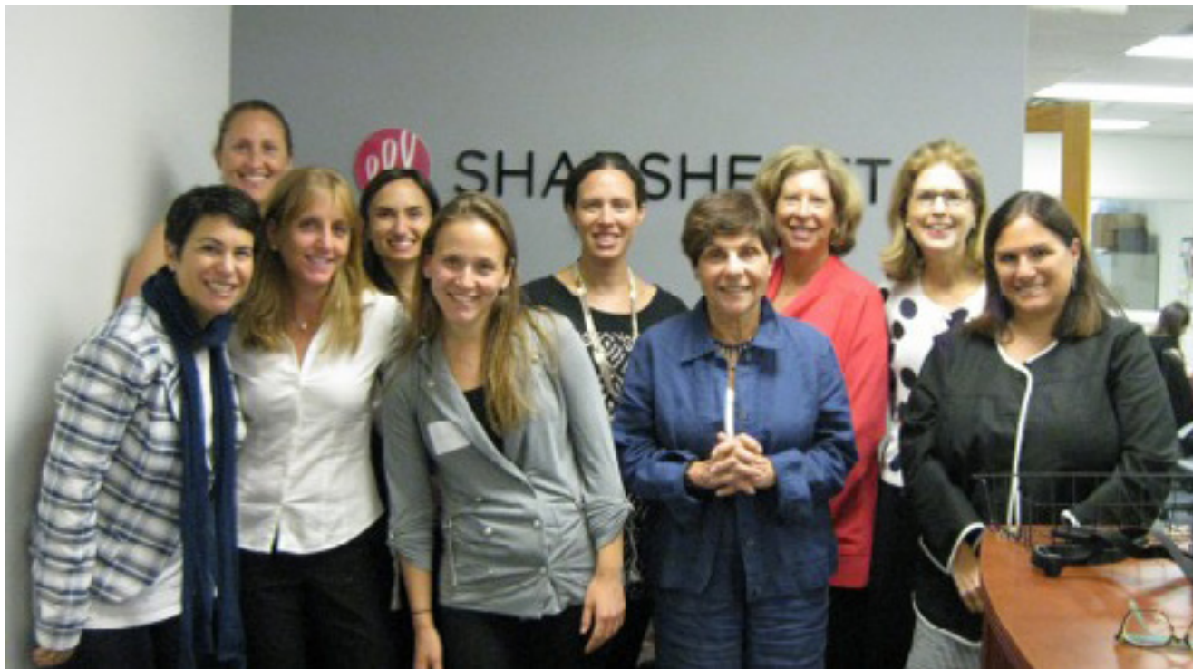
Jewish Women's Foundation of New York— Sharsheret site visit

Working collaboratively, Natan members leverage the financial and intellectual capital of other members and together, they make wise decisions that have real impact. Natan has given away almost $10 million in its lifetime—consisting entirely of member contributions.