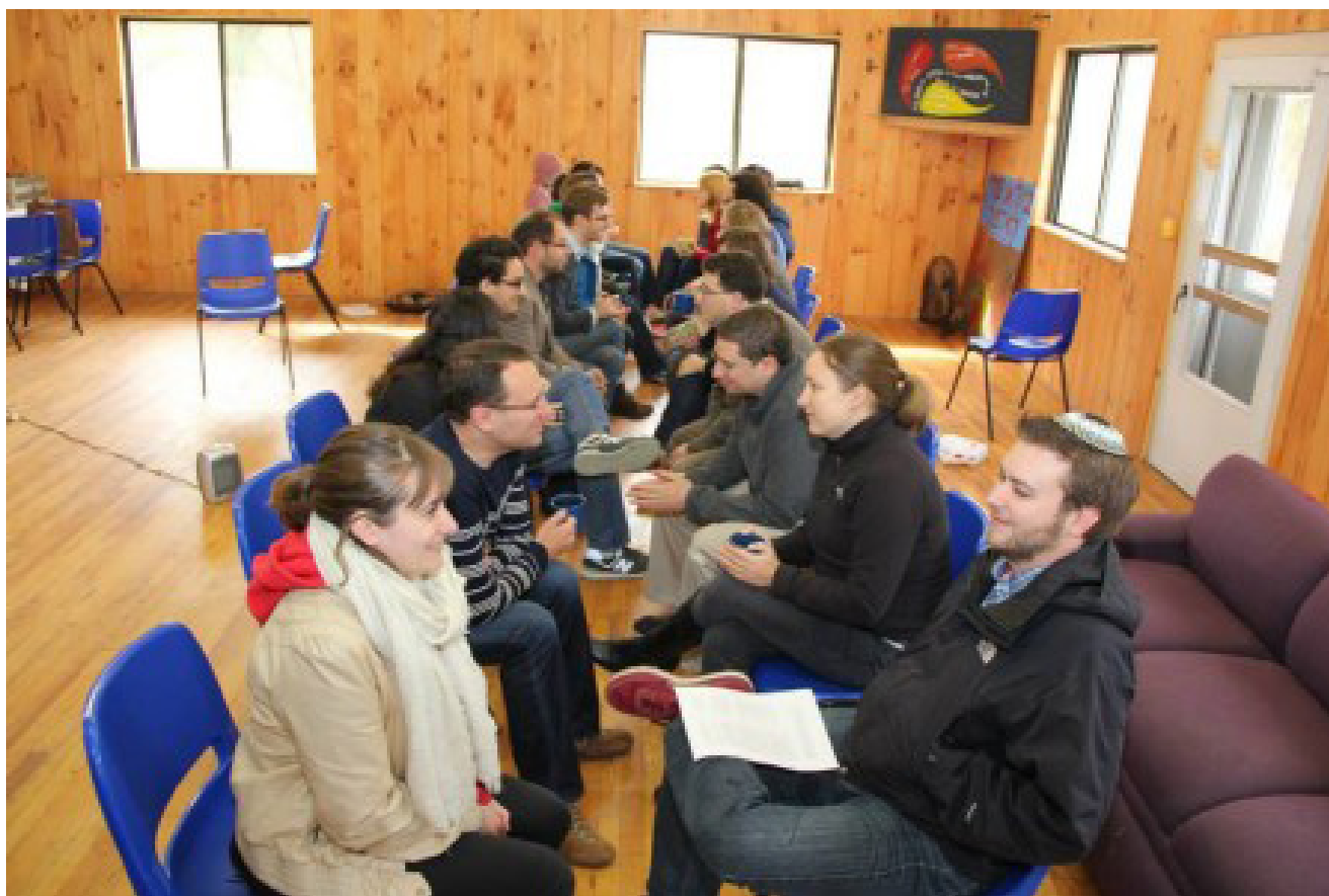
Bronfman Youth Fellows Alumni Advisory Board discusses the Alumni Venture Fund giving circle.

Giving circles also empower people to enter Jewish conversations, tackling discussions about Jewish values, communal issues, and their visions for the Jewish people and the world. It's a deeply powerful, meaning-making experience, and your organization is providing it.