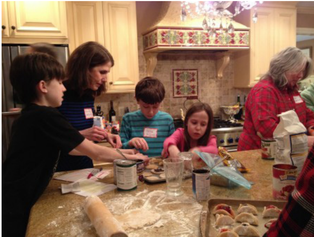
Acharai Fund Purim party

we see our grant review process and our event calendar as ways to educate members, connecting them to Jewish issues and Jewish life in new ways (including an annual trip to Israel); we plan events, meetings, and other network-weaving activities, positioning Natan as an important personal and professional community for our members; and we primarily support Jewish and Israeli organizations. These traits and decisions reflect the interests of our particular group of members.