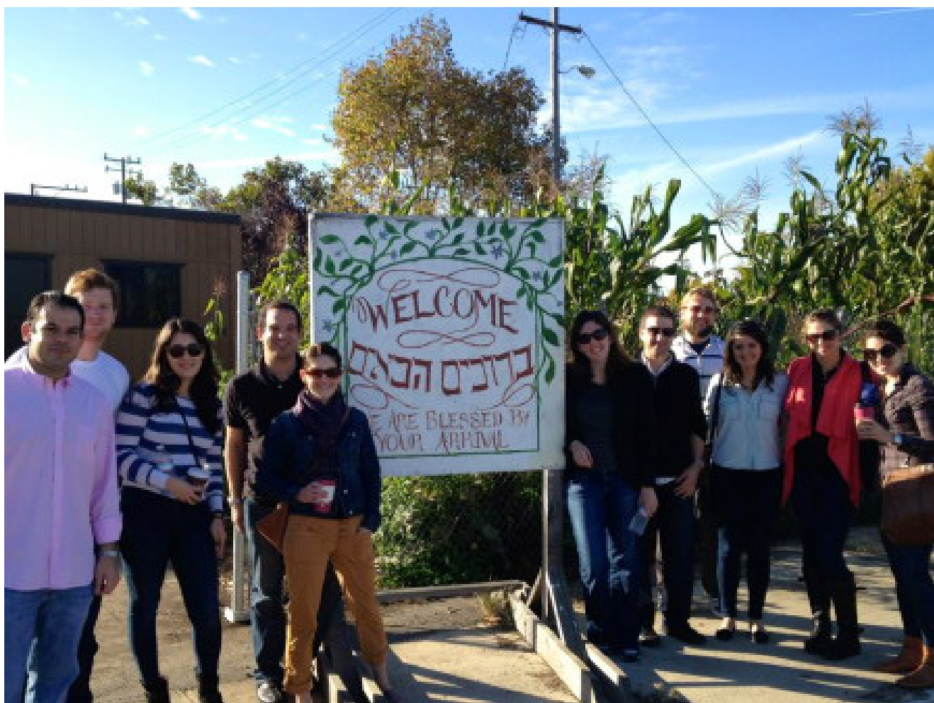
Slingshot Fund site visit